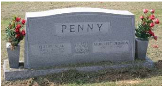
Find A Grave Memorial# 42480481