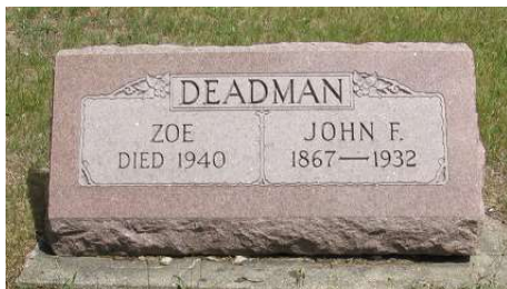
Find A Grave Memorial# 124910774