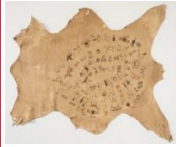
I am fairly certain this is not the Deadmond Robe, but it serves as an example, I am still searching for an actual photograph of the robe.

"It's a really neat piece of Montana history. I think it's pretty great that we have something right in a local museum that you would (otherwise) have to travel to the Smithsonian to see. But it's actually in Townsend, and if not for a local volunteer who recognized the fact that it was indeed a bison robe that had some sort of paintings on it, it would not be here today. It would have been thrown out."