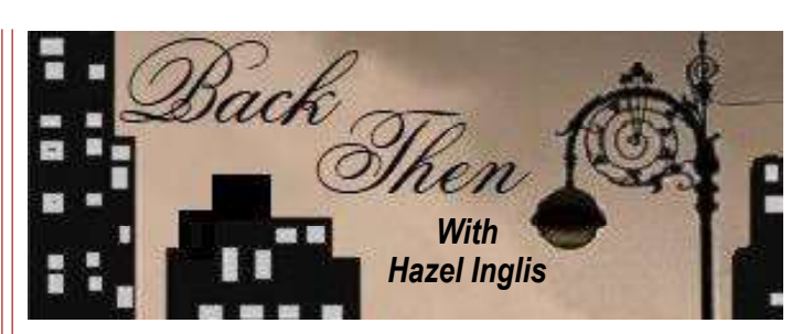
This obituary was originally published in Volume 112, but we felt it would be good to repost it.

The Kinsley graphic. July 18,(Kinsley, Kan.)