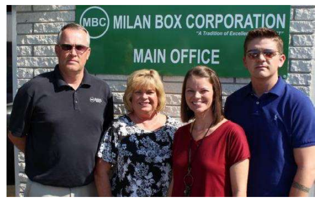
MILAN BOX CORP. LEADERS

Milan Box continued to produce wire-bound vegetable crates, wire-bound ammunition boxes and wooden boxes, up to and after the Vietnam War. During the Vietnam War, the company shifted production to focus primarily on military packaging instead of vegetable crates. After the war, Milan Box continued to conduct commercial business with several businesses.