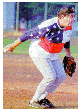
Here I am at the age of 60 tossing the ole "pumpkin" while playing in the Senior League at Woodstock, GA.

When I moved to Springfield, TN in 1972 at the age of 33, I came out of retirement and began my slow pitch softball career which lasted for more than 30 years. I did become the pitcher of my youthful dreams