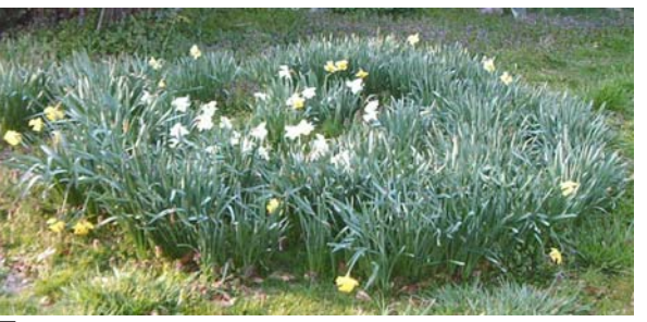
THE YARD IS FILLED WITH FLOWERS THAT KEEP COMING BACK EACH YEAR. I CALL THESE FLOWERS, BUTTERCUPS. I THINK THERE ARE OTHER NAMES.

yard would be quite bare without them. I have learned a lot about the great outdoors since moving back to the old home place five years ago. However, there is still much to be learned. I am amazed at what mother knew about such stuff. I am reminded of the beauty of nature and God's creation every day.