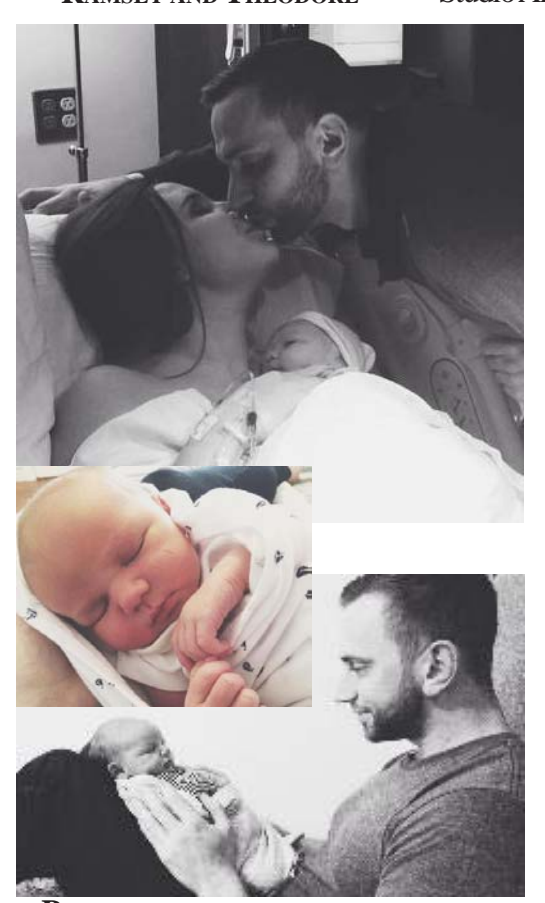
PROUD PAPPA ADMIRING HIS NEW SON