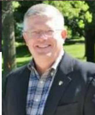
40 YEARS LATER