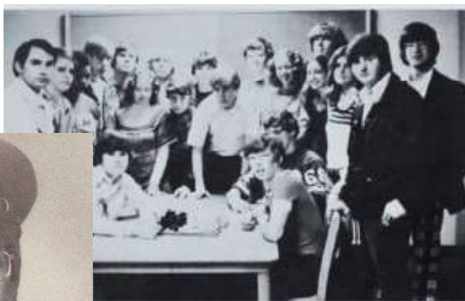
CHESS CLUB MEMBERS