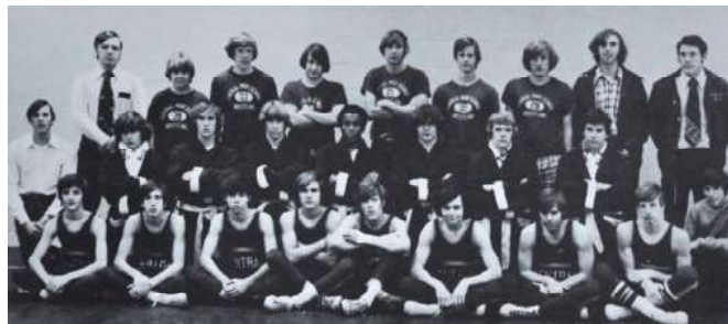
MEMBERS OF THE 1973-74 WRESTLING TEAM